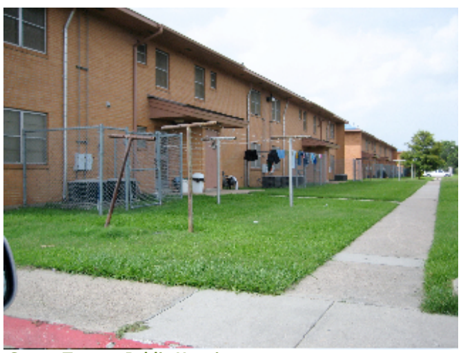
Carver Terrace Public Housing

The Motiva facility, jointly owned by Shell Oil and Saudi Aramco, is not the only oil refinery or petrochemical plant fouling the air in this largely African-American and low-income neighborhood. Heavy emissions are also released into the air by the Valero refinery, Huntsman Petrochemical, and the Chevron Phillips plant, as well as the Great Lakes Carbon Corporation's petroleum coke handling facility. The air is further burdened by massive releases from a major refinery owned by Total Petrochemicals USA (formerly Final Oil), Premcor Refining, as well as BASF Fina Petrochemicals located a few miles away in East Port Arthur. One mile to the west there is also a hazardous waste incinerator owned and operated first by Chemical Waste Management and subsequently by Onyx Environmental Services, which pumps out over 100 tons in criteria air emissions in 2004.