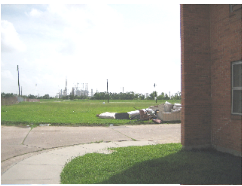
Evictions at Carver Terrace

Dressed in a bright yellow t-shirt and cap emblazoned with CIDA's motto: "A United Voice for and by the