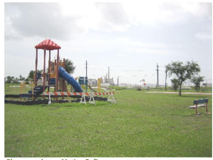
Playground near Motiva Refinery

chemicals were released, which way the wind was blowing, where elevated levels of toxic chemicals were detected, and where residents reported odors and symptoms. When all this information was combined on a map it made a compelling case. Community members were alarmed when they saw the maps, Subra remembers. They studied the map to see where they lived. worked and went to church and then looked at the level of pollution reported. "Suddenly they were no longer afraid to ask questions and participate in events about how the health of their community was being impacted," she recalls.