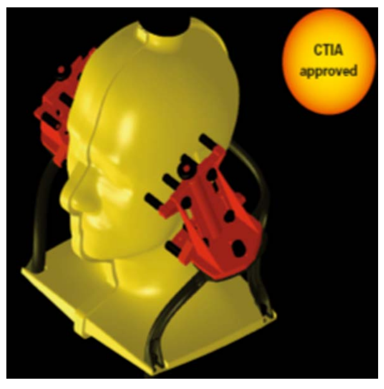
FIGURE 1 SAM Phantom. Source: Speag Phantom Product Flyer. "CTIA" is Cellular Telecommunications Industry Association.