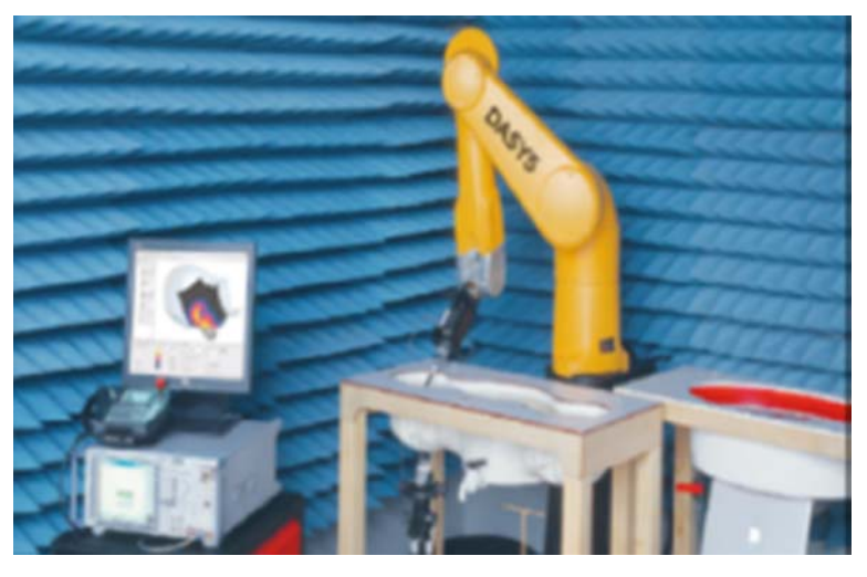
FIGURE 2 Robotic arm with electric field probe.

For the computer simulation certification process, the revised FCC Supplement C publication states, "Currently, the finite-difference time-domain (FDTD) algorithm is the most widely accepted computational method for SAR modeling. This method adapts very well to the tissue models that are usually derived from MRI or CT scans such as those currently used by many research institutions. The FDTD method offers great flexibility in modeling the inhomogeneous structures of anatomical tissues and organs (Means and Chan, 2001, p. 13)."